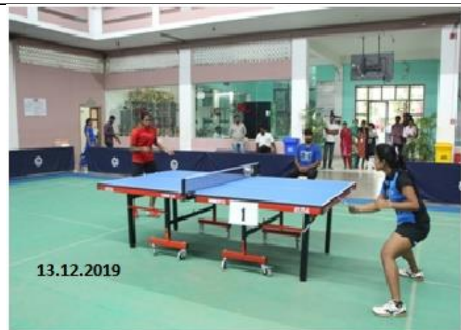
Players in action