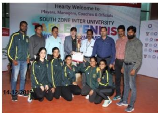
Osmania University, 2 nd Place