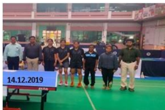
University of Calicut, 4 th Place