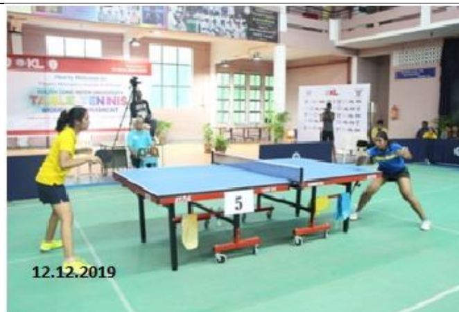
Players in action