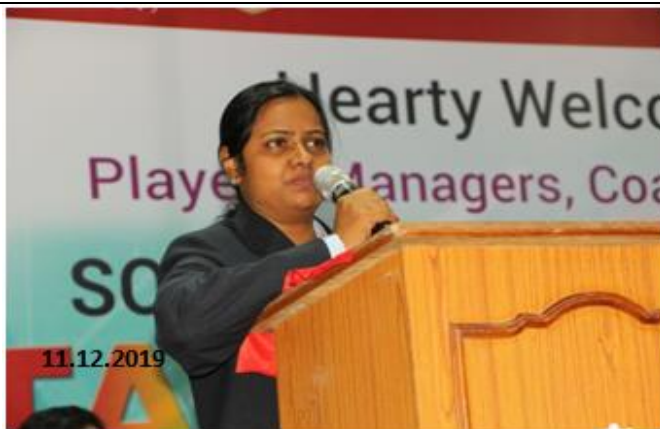
Address by the Chief Guest