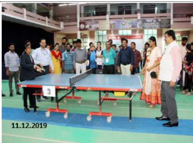
Chief Guest Declaring the Game Open