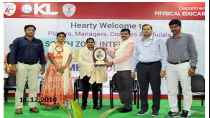
Felicitation to the Chief Guest