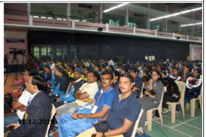
Gathering of the Players during the Inauguration