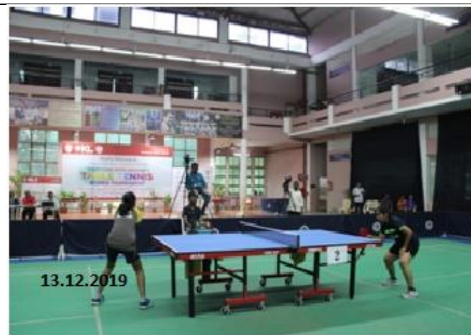
Players in action