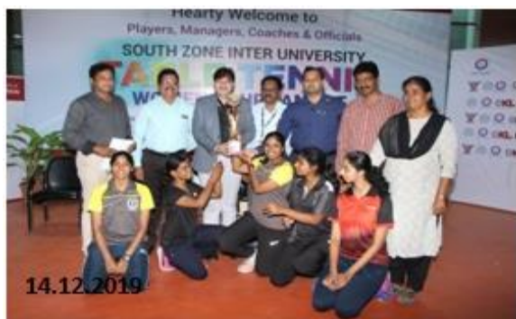
University of Madras, 3 rd Place