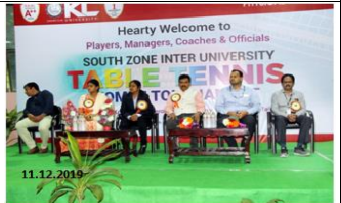
Dignitaries on the Dias during Inauguration