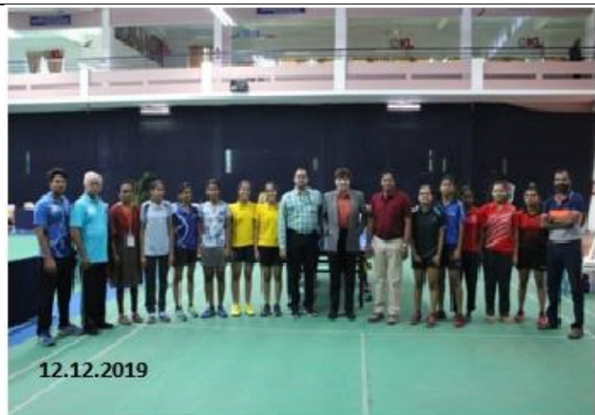
Players with the Principal of COE