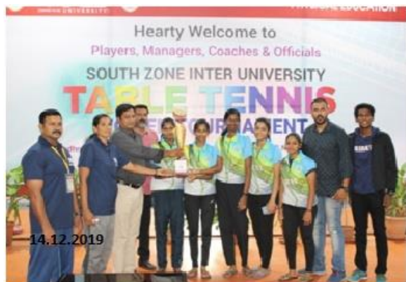
SRM University, 1 st Place